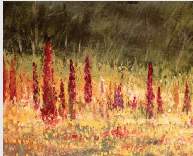
Painting on canvas, oil look with Fleur.