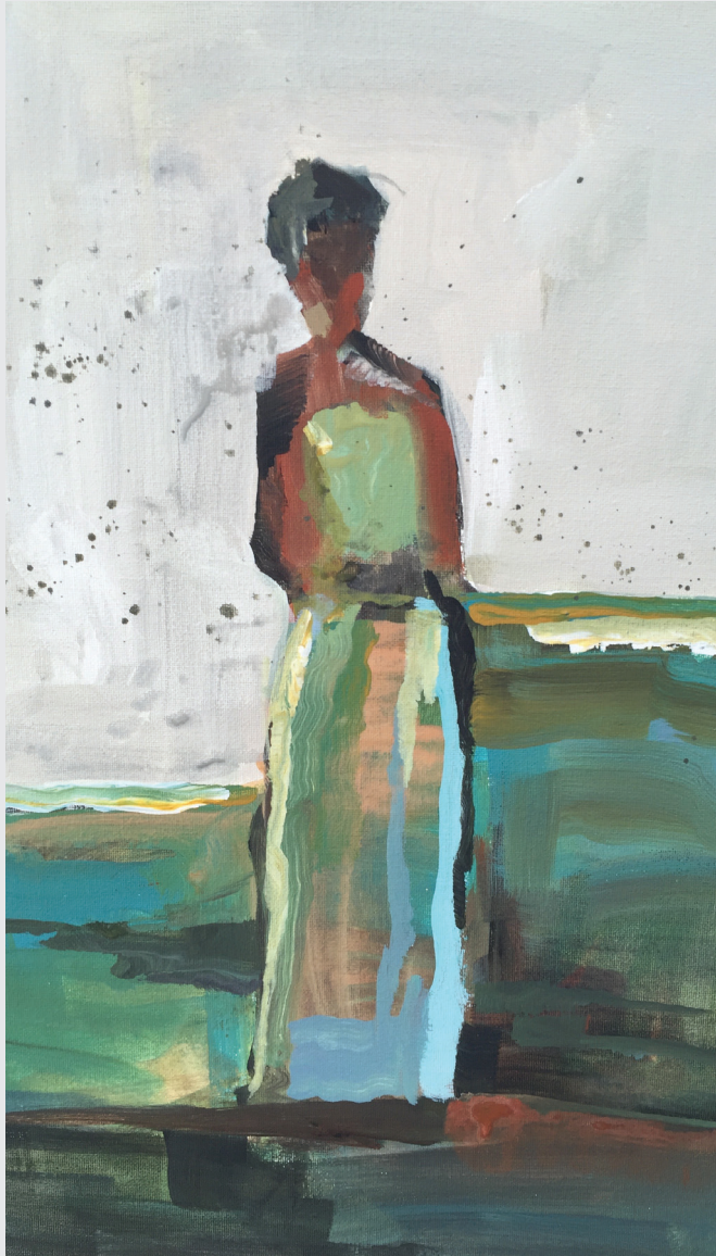
Painting on canvas made with Fleur.

Furthermore, thanks to its extreme versatility artists can use it on any surface, mixing and matching it with several mediums, according to their preferences and needs: liquid paint, sprays and markers. Our line also includes many mediums developed in collaboration with artists for artistic uses.