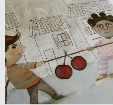
Fleur used for illustration. (Chiara Bolometti)