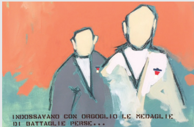
Fleur used on wood. (Jack Quick)

If you look at an object painted with Fleur, you do not see a flat, "synthetic" mattness, but rather diffused light. You have the visual sensation of sinking into the colour and the final effect is very natural.