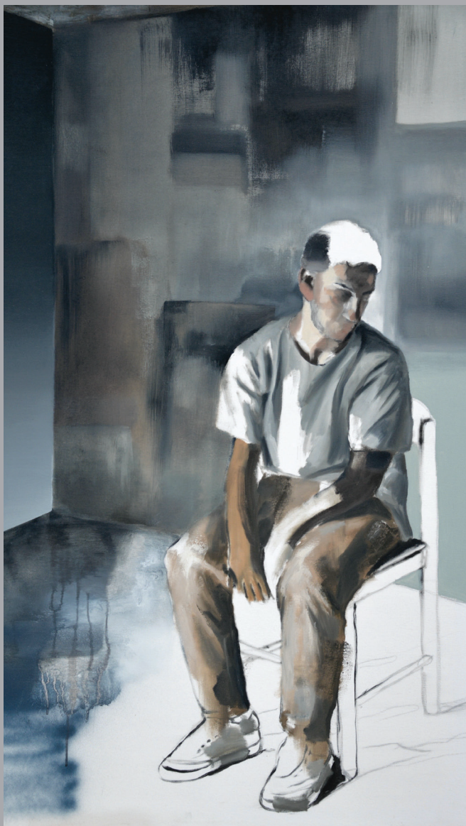
Fleur used on canvas. (Lorenzo Ermini)