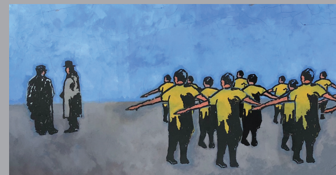
Fleur used for screen printing. (Jack Quick)

Fleur Paint originates from 70 years of experience in the production of paint for restoration, which was traditionally used to restore historical paintings, frescos and all kinds of artworks.