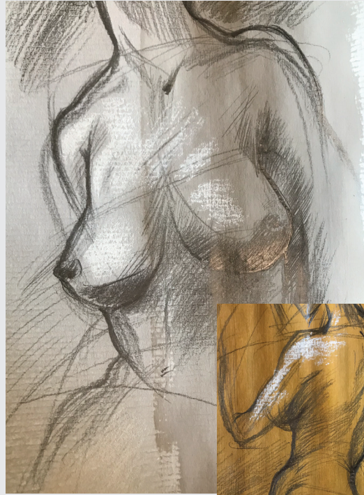
Fleur used as ground for pencil and coloured pencil on paper. (Mara Apostoli)