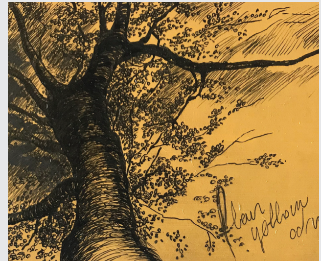
Fleur used as ground for Indian ink on rubber. (Mara Apostoli)